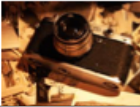
PHOTO AND TECHNOLOGICAL CLUB