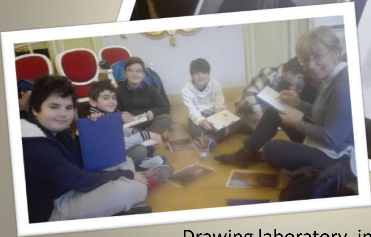
Drawing laboratory inside the Art Museum