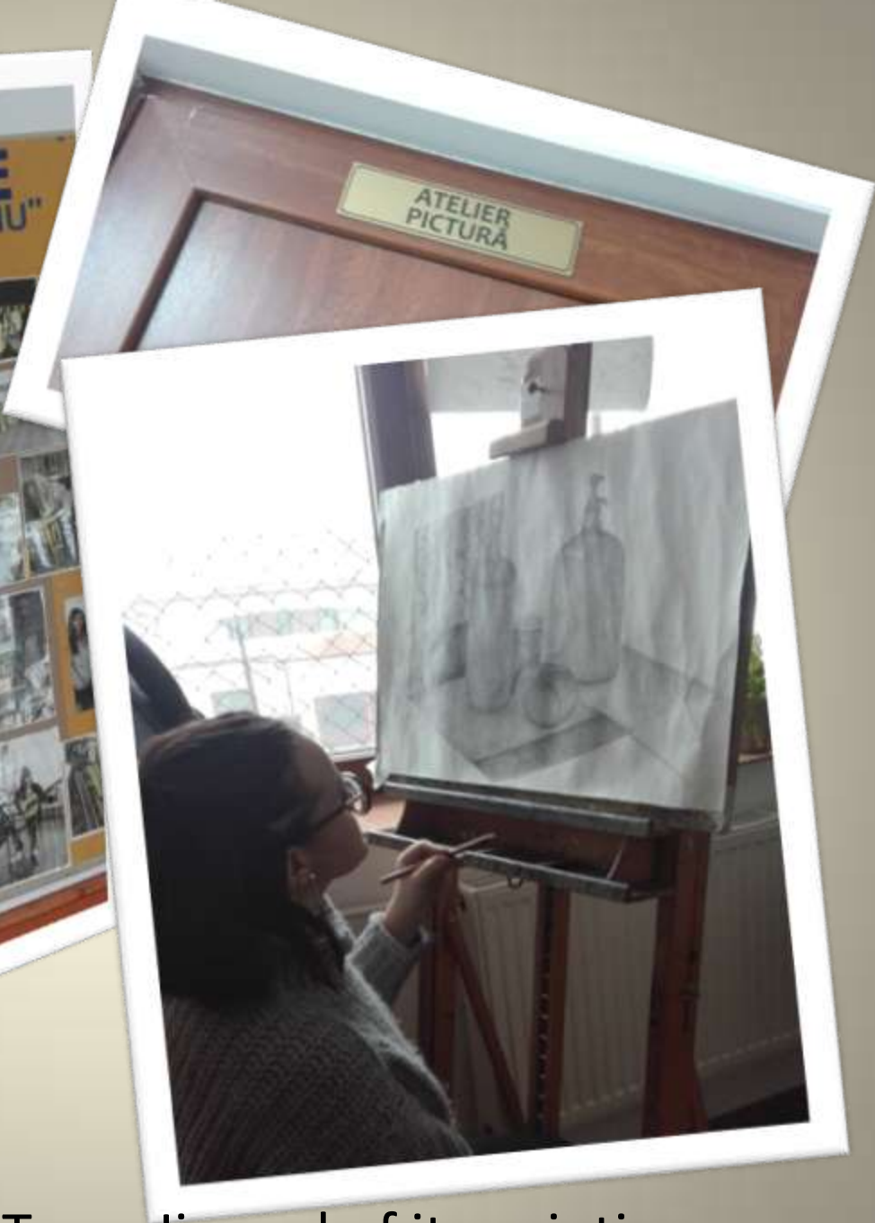
Visit at the Art Liceum of Targu Jiu and of its painting room