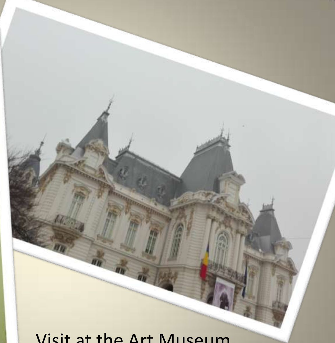
Visit at the Art Museum of Craiova