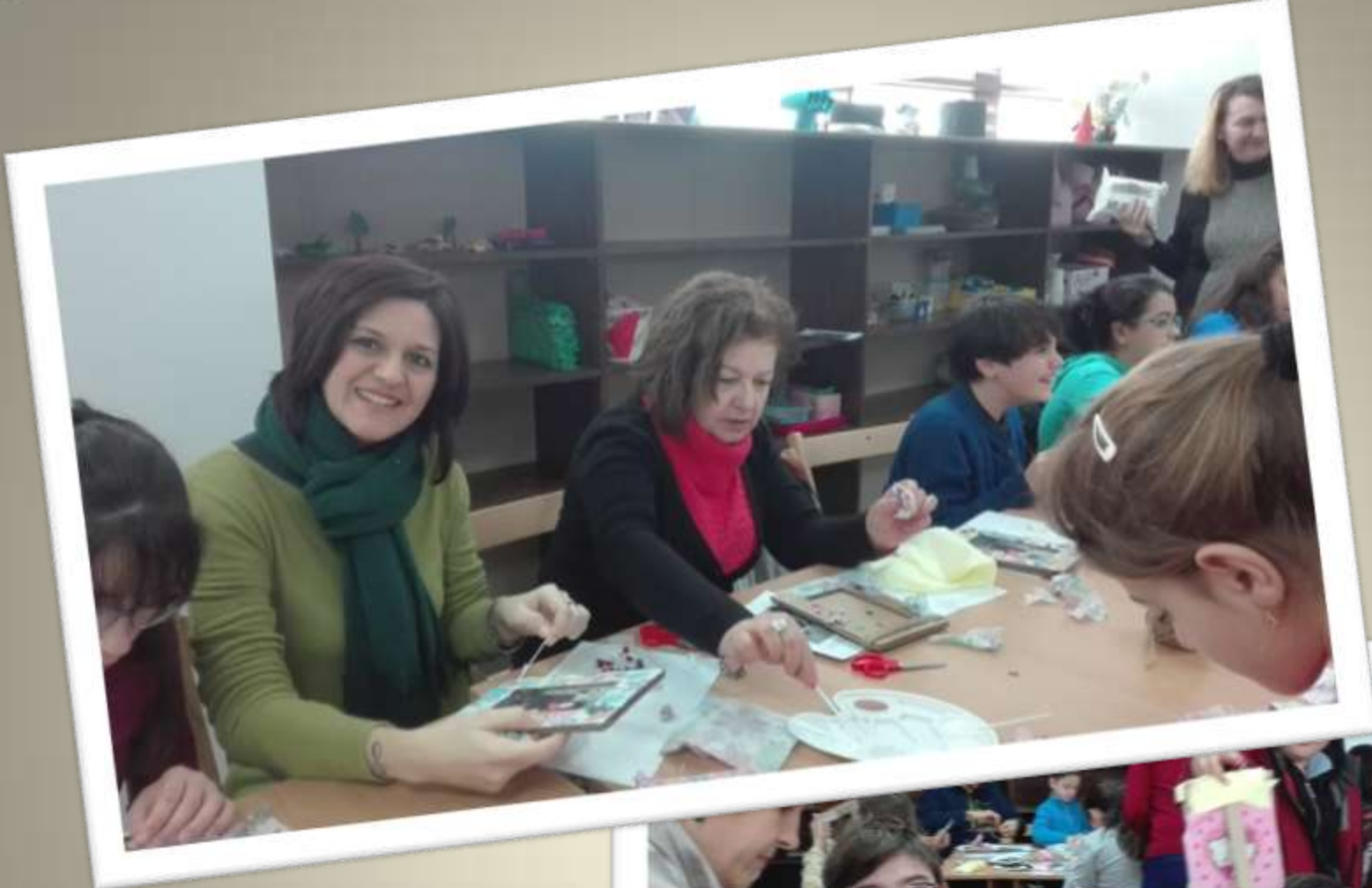
Art Laboratory for students and teachers inside the Museum.